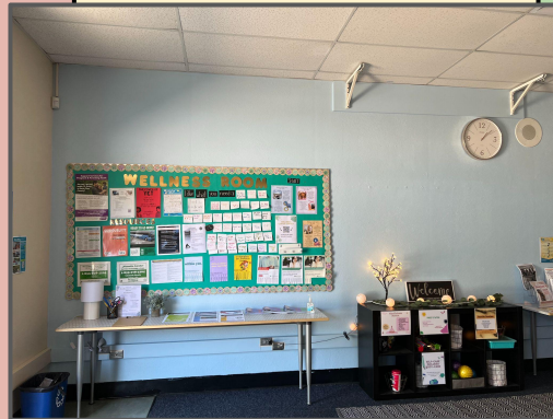
Wellness Center Room 403

Academic help: Reach out to your teacher(s), attend office hours, see your counselor.